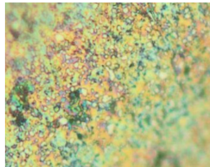
Fig. 5. Sample microstructure 2 (500X)