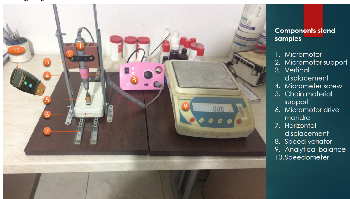
Fig. 6. Stand dental milling tests [10]

After conducting the test samples according to the validation standards, measurements shall be made weighing both the test material and the test cutters.